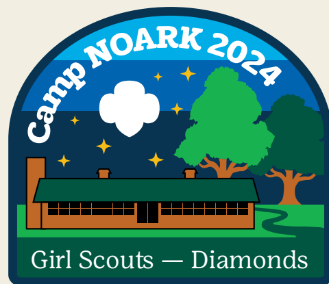
2024 Camp Patch